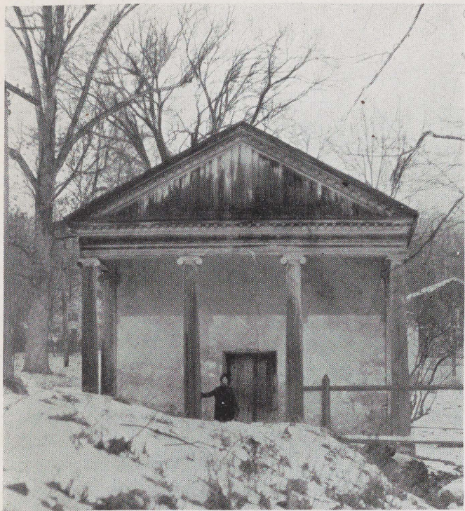
THE OLD SPRING HOUSE IN WINTER

The chaste beauty of the old spring house in the Falls Road section of Roland Park is never emphasized more strongly than when it is etched against a snowy landscape.