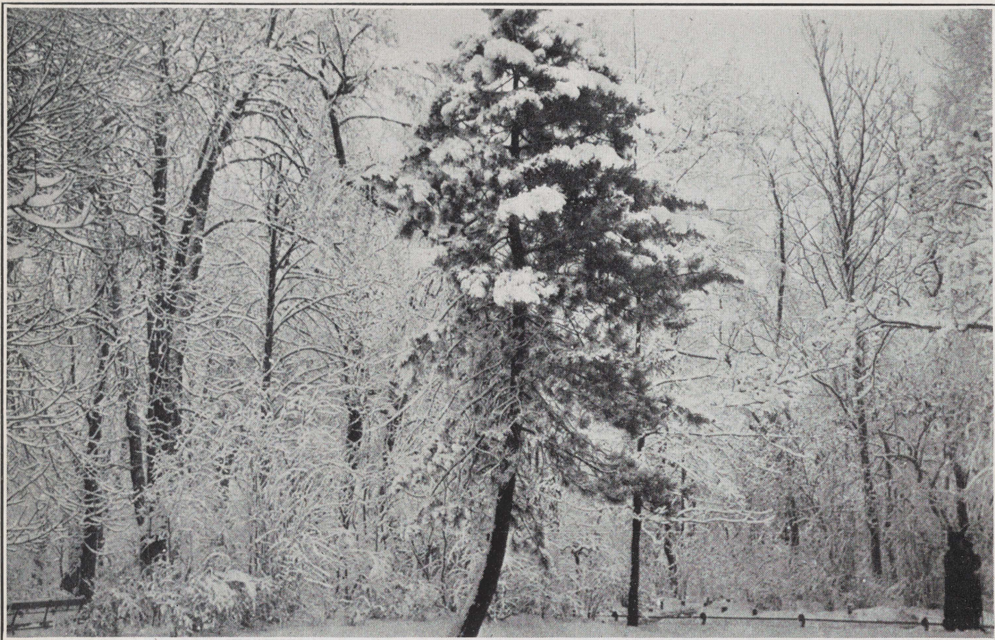
TYPICAL WINTER SCENE IN THE ROLAND PARK-GUILFORD DISTRICT

Decked as if for some royal festival, The lonely pine has flung a cloak Of ermine over her emerald robes.