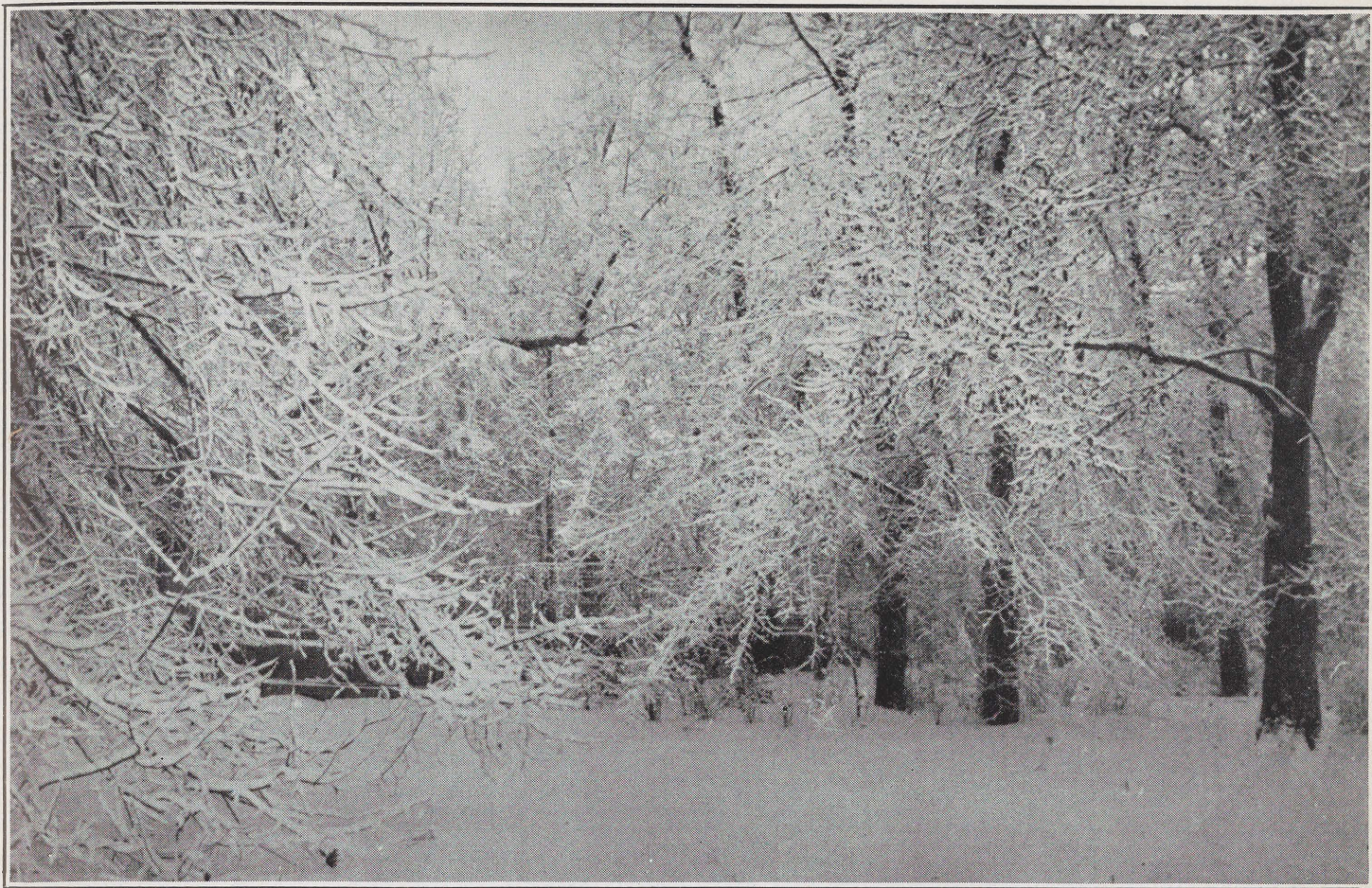
ANOTHER VIEW IN THE ROLAND PARK-GUILFORD DISTRICT AFTER A LATE FEBRUARY STORM

This and the other snow pictures in the present issue of our Magazine were selected primarily because we thought them attractive.