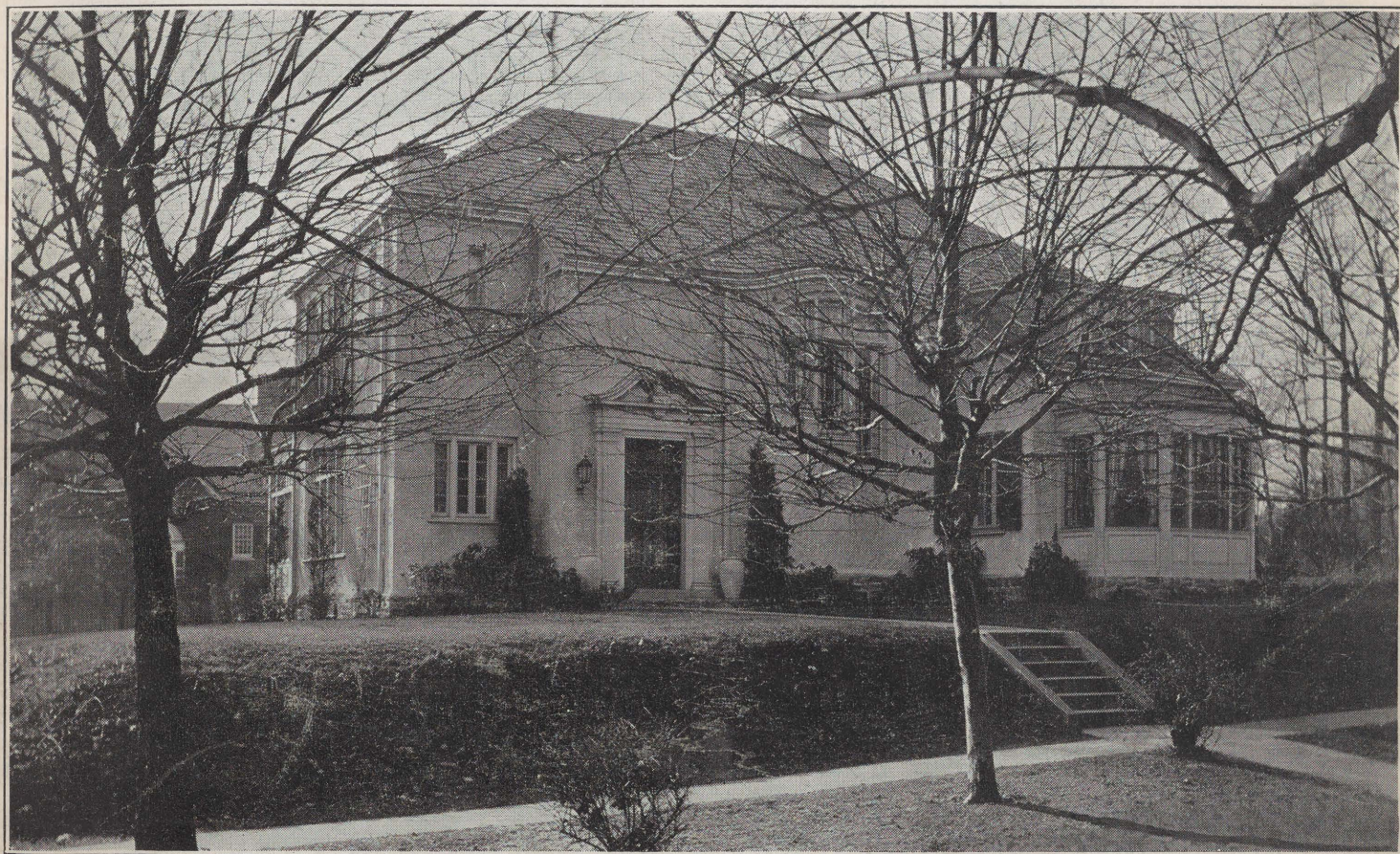
HOUSE SHOWING ITALIAN INFLUENCE

DEVOTED TO NEWS OF ROLAND PARK ∴ GUILFORD ∴ HOMELAND