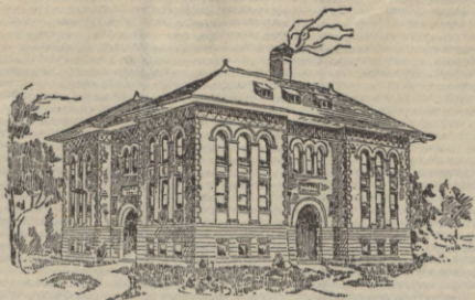
Academy Incorporated 1892.