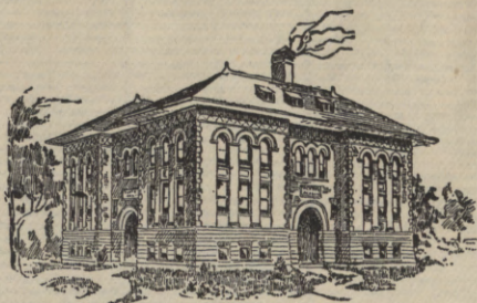
Academy Incorporated 1892.